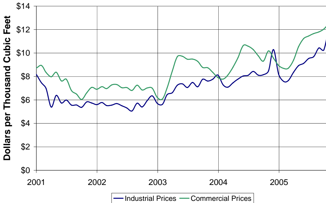
Industrial and Commercial Natural Gas Prices